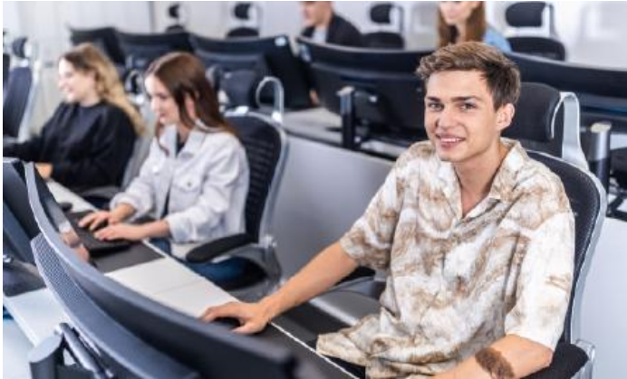
The Business Process Simulation Center and DT Workspace